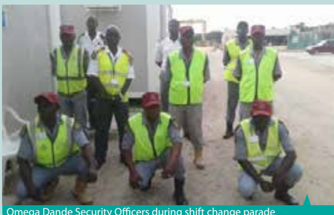
Omega Dande Security Officers during shift change parade