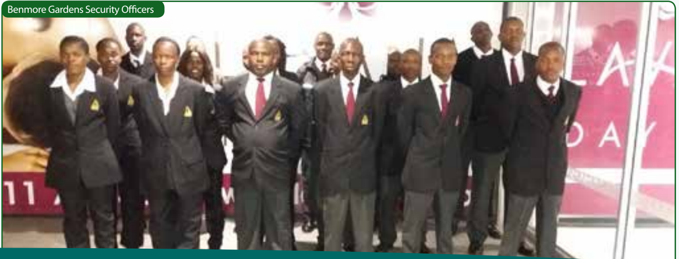
Benmore Gardens Security Officers

To the newly appointed security officers that will be privileged in serving Benmore Gardens Shopping Centre, we wish you all the best and believe that you will strive to grow in excellence in the common goal of serving our new client with integrity and professionalism.