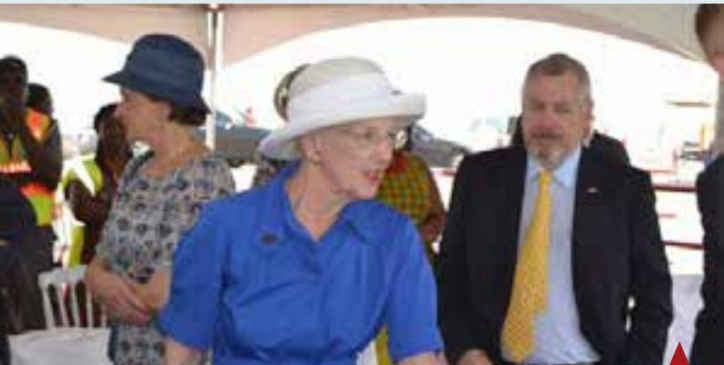
Her Majesty Queen Margarethe II (middle)