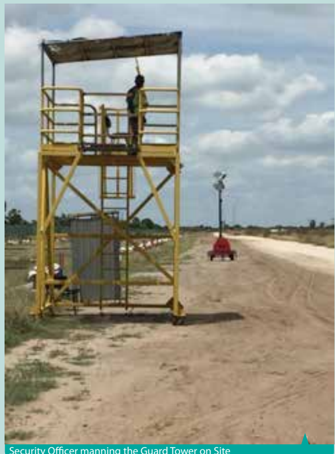
Security Officer manning the Guard Tower on Site