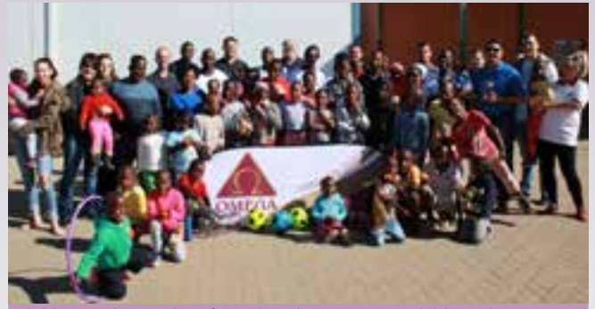
Children and Caretakers from the Tshwaraganang children's home as well as the Omega team.

There is no better way to describe this day than the true words spoken by Nelson Mandela himself: "What counts in life is not the mere fact that we have lived. It is what difference we have made to the lives of others that will determine the significance of the life we lead."