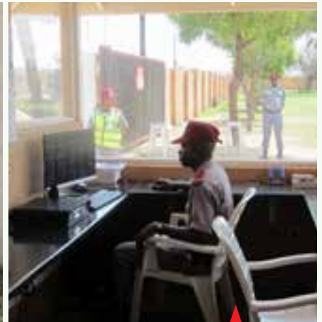
Arkhê Risk Solutions control room on site at VDE where all CCTV and alarms systems are monitored