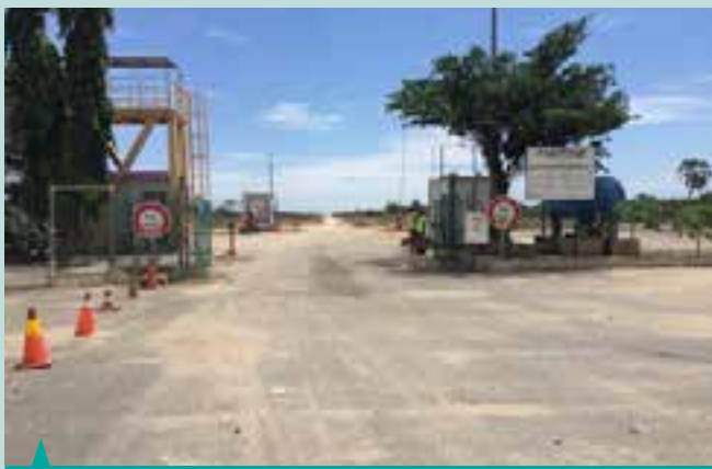
Dande Main Gate

The base has a huge infrastructure consisting of 32km of roads, accommodation for 500 people, workshops, offices, catering facilities, its own power supply plant, water purification plant and much more. This illustrates the enormity of Omega's responsibilities which inter alia includes securing of the whole area of operations, managing the sub-contractors and suppliers, maintaining of all procedures, Health and Safety, general base management and a variety of maintenance activities.