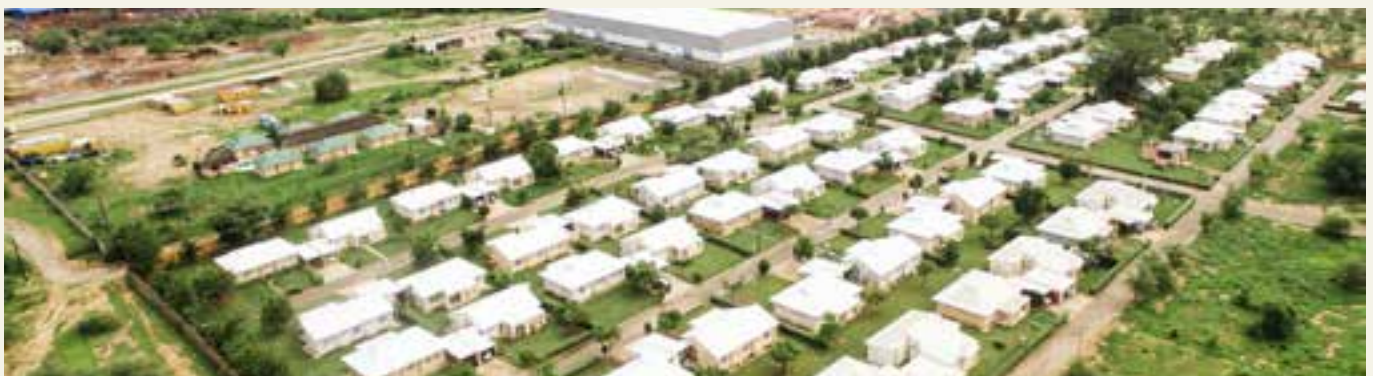
Birdseye view of the residential area providing accommodation to mainly VALE middle and senior management

Commodity House Phase 1, KPMG/Hollard Building, Vodacom Building, Zimpeto Square, Bolloré Warehouse [PEMBA], Mall de Tete, Commodity House Phase 2, VDE Housing Estate.