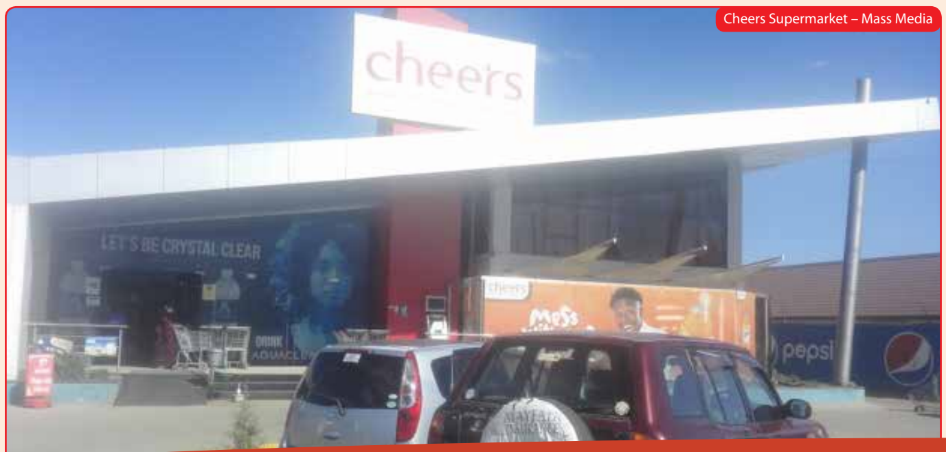
Cheers Supermarket – Mass Media

Omega security officers are involved in store security and stock management at both sites. Cheers Kabwata is the hub of activities and is extremely busy over weekends. A long future is envisaged with Cheers Supermarkets.