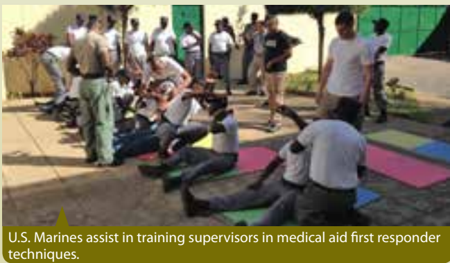
U.S. Marines assist in training supervisors in medical aid first responder techniques.