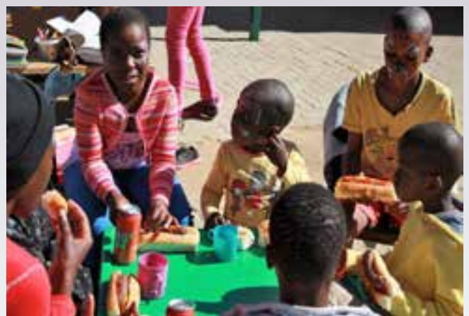
The children enjoying their lunch

The children's home is a non-profit organisation and consists of 55 children, ages ranging from 1 years to 19 years old.