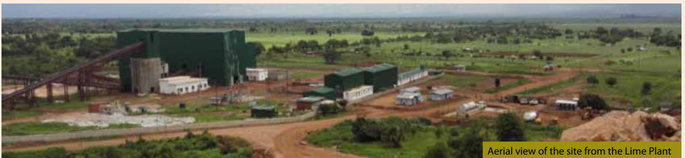
Aerial view of the site from the Lime Plant