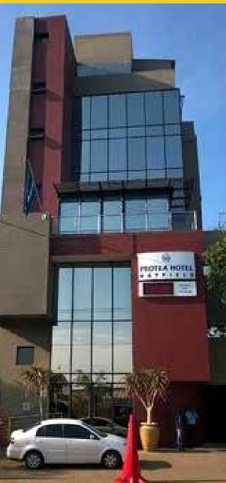
Protea Hotel Hatfield

Omega believes that with the Hotel Industry specific training we provide to our carefully selected security officers, that we will soon be the preferred supplier to the Marriott Group of Hotels. We also pride ourselves in understanding the client's needs and requirements and focus our efforts in achieving these requirements. We are proud to be associated with one of the most widely recognized hospitality brands in Africa with the most extensive footprint.