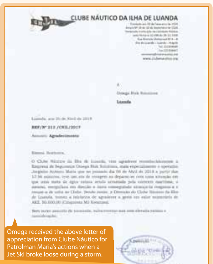
Omega received the above letter of appreciation from Clube Náutico for Patrolman Maria's actions when a Jet Ski broke loose during a storm.

Numerous vendors are active in the area. They move around in small canoes and security officials are responsible to make sure they do not approach the anchored boats or approach the boats docked in the dry dock for maintenance.