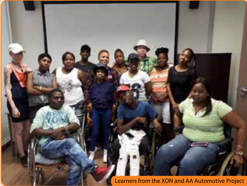
Learners from the XON and AA Automotive Project

The qualification will entail that persons involved in the security environment will be able to practice the necessary knowledge, skills and attitudes to operate in a professional manner.