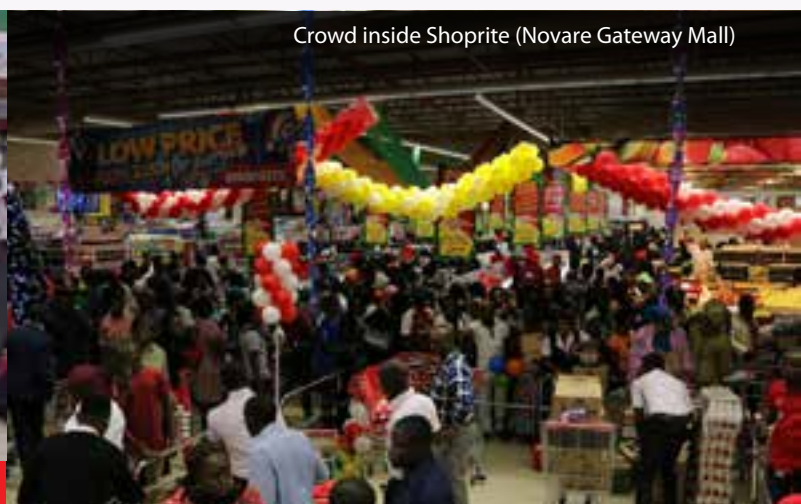
Crowd inside Shoprite (Novare Gateway Mall)