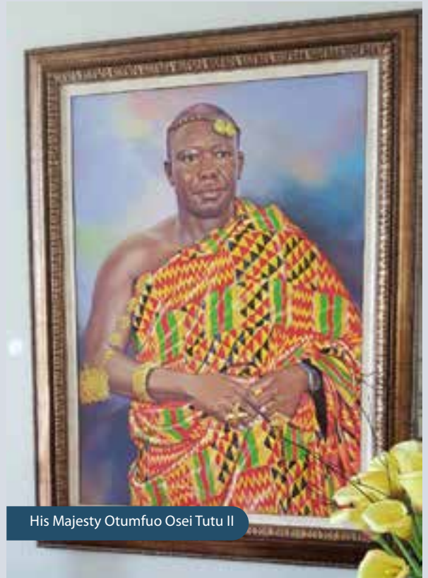
His Majesty Otumfuo Osei Tutu II