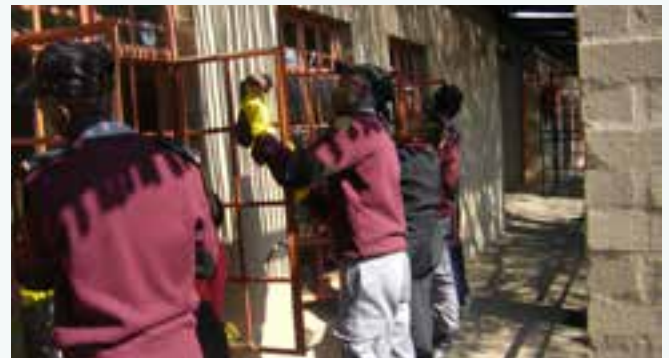
ORS Staff & Students washing windows at Mthimkhulu Centre and Housing for the Aged in Witbank